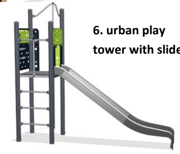
6. urban play tower with slide