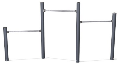
3. Somersault Bars