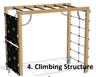
4. Climbing Structure