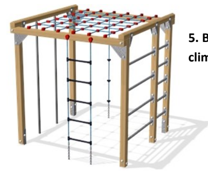
5. Box climber