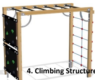
4. Climbing Structure