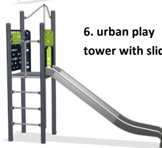
6. urban play tower with slide