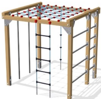
5. Box climber