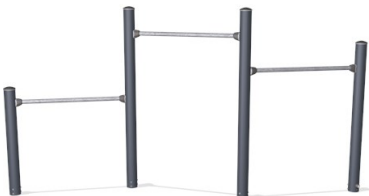
3. Somersault Bars